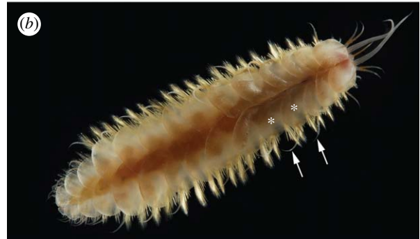
Figure 2. (a) Macro photograph of Trypanosyllis zebra (Syllidae) from England, showing shorter and horizontally directed DC alternating with longer and more upturned ones. The arrows point to two median segments with shorter DC and the asterisks are situated at the bases of longer DC. The whole animal is 5 cm long. (b) Macro photograph of Byligides elegans (Polynoidae) from Sweden, showing alternating elytrae (scales) and DC (the elongated appendages that emerge below the elytrae but above the chaetae). The arrows point to DC on two segments, and the asterisks are situated on two elytrae. The whole animal is 3 cm long.

sister to these and Aphroditidae more distant (Struck et al. 2005; Wiklund et al. 2005). If DC alternation patterns are heritable traits then we would expect to find similarities at the family level that are congruent with our current knowledge of phylogeny.